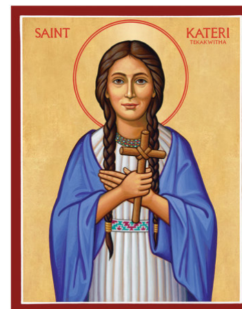
Patron of those in exile & Native Americans

r.i.p. (requiescat in pace: rest in peace), a.i.d. (ad intentionem donoris: for the intention of the donor) pro sal. (pro salutem: for health), pro populo (for the people)