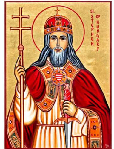
bricklayers, Hungary, kings.