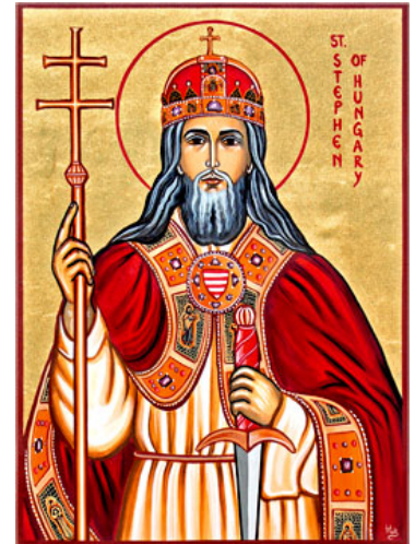
bricklayers, Hungary, kings.