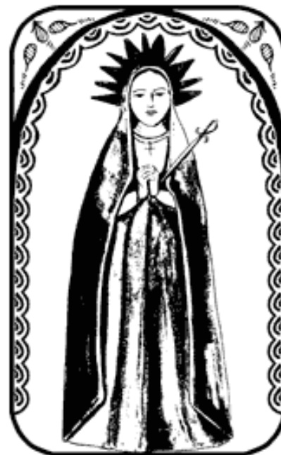
Our Lady of Sorrows