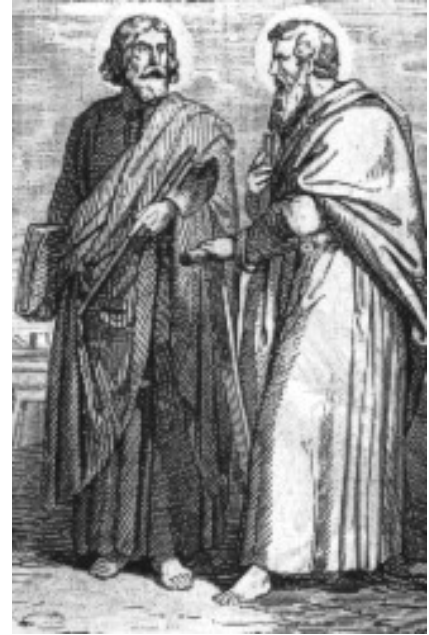
Saint Simon: Patron of carriers, sawyers, tanners