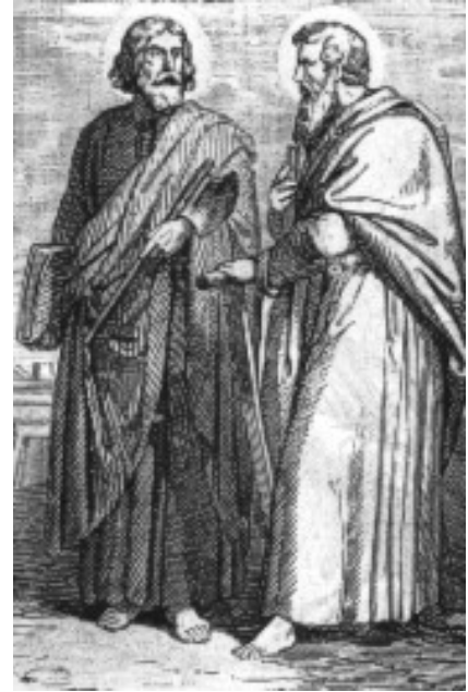
Saint Simon: Patron of carriers, sawyers, tanners Saint Jude: Patron of lost/desperate causes

r.i.p. (requiescat in pace: rest in peace), a.i.d. (ad intentionem donoris: for the intention of the donor)