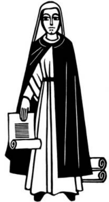
SAINT CATHERINE OF SIENA